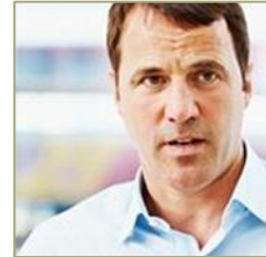
Bill needs an attorney experienced in formulating personalized business exit plans and estate plans for business owners in the Palo Alto area.

It's essential that Bill formulate an estate plan that addresses every aspect of the business succession plan and that as each phase of the succession plan is achieved, the estate plan is updated accordingly. He needs an attorney experienced in formulating personalized business exit plans and estate plans for business owners throughout the Palo Alto, Los Altos, and San Francisco Bay areas.